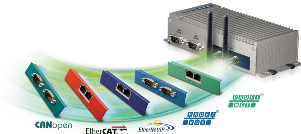
Figure 1 - This industrial PC can be easily customized for the intended application by adding a range of standard networking and other features, all without modifying the internals of the computer.

Advantech, a manufacturer of IPCs and other automation products, has recently introduced a concept they call iDoor Technology, which is program where a wide variety of standardized hardware platforms and technologies can be pre-configured to meet specific customer needs. With iDoor Technology, users can select from various communication connectivity types and protocols, standard memory and storage formats, as well as digital and analog input and output capabilities using the standard size of 81 x 19.4 mm (Figure 1).