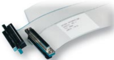
Figure 10. R6868 Ribbon I/O Cable