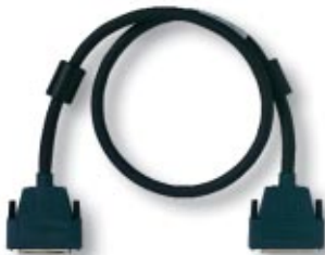
Figure 9. SH68-68-D1 Shielded Cable