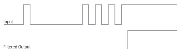
Figure 2. Debouncing and Glitch Removal

Calibration is a key component of any measurement solution. In the case of counter/timers, timebase calibration ensures that the frequency and time measurements are accurate. Calibration certificates enclosed with the National Instruments counter/timers and periodic calibration satisfy your ISO-9000 requirements, certifying that your instrument has been properly calibrated. See page 21 for more information.