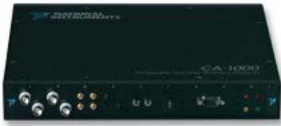
Figure 2. CA-1000 Configurable Signal Conditioning Solution