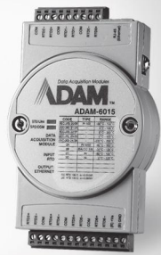
ADAM-6015 FCC CE RoHS UL US

Vertrieb durch AMC AMC – Analytik & Messtechnik GmbH Chemnitz Heinrich-Lorenz-Str. 55 Tel.: +49/371/38388-0 09120 Chemnitz Fax: +49/371/38388-99 E-Mail: info@amc-systeme.de Web: www.amc-systeme.de