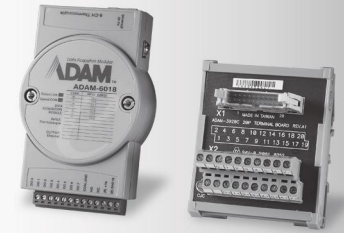
ADAM-6018 FCC CE RoHS UL US