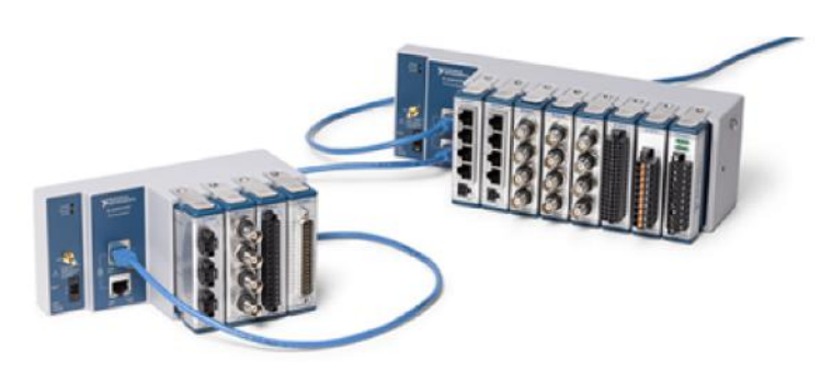
Figure 1. Easily expand your system with an integrated network switch for simple daisy chaining.

For long-distance, distributed systems, you can use a Time Sensitive Networking (TSN) enabled CompactDAQ device. TSN is the next evolution of the IEEE 802.1 Ethernet standard. It provides sub-microsecond synchronization over a distributed network of DAQ nodes. Precise timestamps and packet-based communication are used to share a common notion of time on all nodes in the network, which allows for accurate synchronization over long distances and eliminates the need for lengthy, physical timing cables.