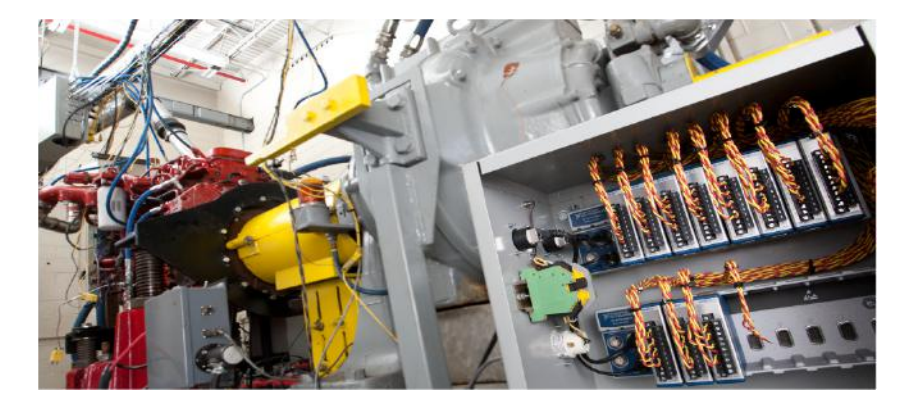
Figure 2. Spend less time preparing instrumentation for the rigors of field testing with CompactDAQ's extended temperature range, shock and vibration resistance.