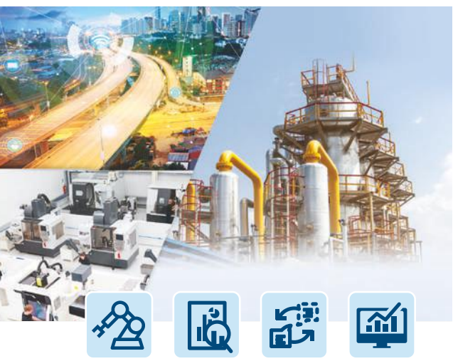
Machine Control Data Analytics