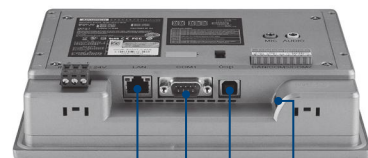
Ethernet COM1 (RS-232/422/485) | USB Client | Micro SD Slot