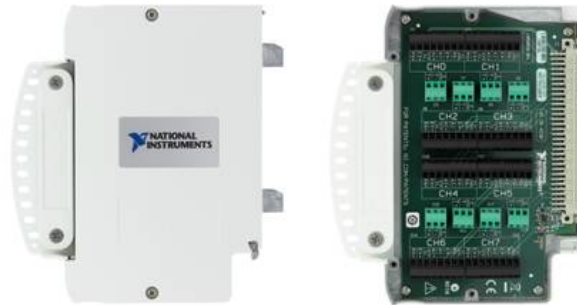
Figure 2. NI TB-4330 Front-Mounting Terminal Block

The NI PXIe-4331 is designed to be used with the NI TB-4330 front-mounting terminal block. The SC Express terminal blocks are hot-swappable and automatically recognized in software. This makes troubleshooting easier because you can connect and remove terminal blocks without powering down the PXI measurement system. Each terminal block also includes alignment fins that guide the connector onto the PXI Express module without bent pins.