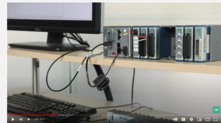
Getting Started with CompactRIO